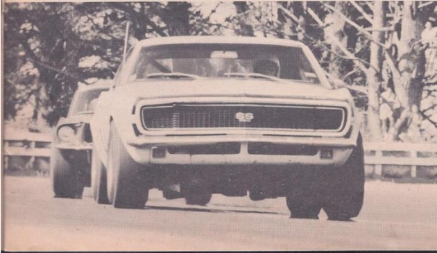
BREAKING the Mustang domination in Group 5 Championship racing, Spinner Black powers the impressive Chevy Camaro out of Beach Bend with Red Dawson in hot pursuit. Fahey finished second in the Championship race with a slowly deflating tyre.